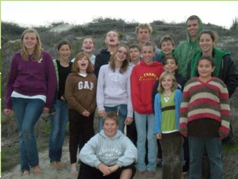
2009 Santa Cruz Team Travel Meet